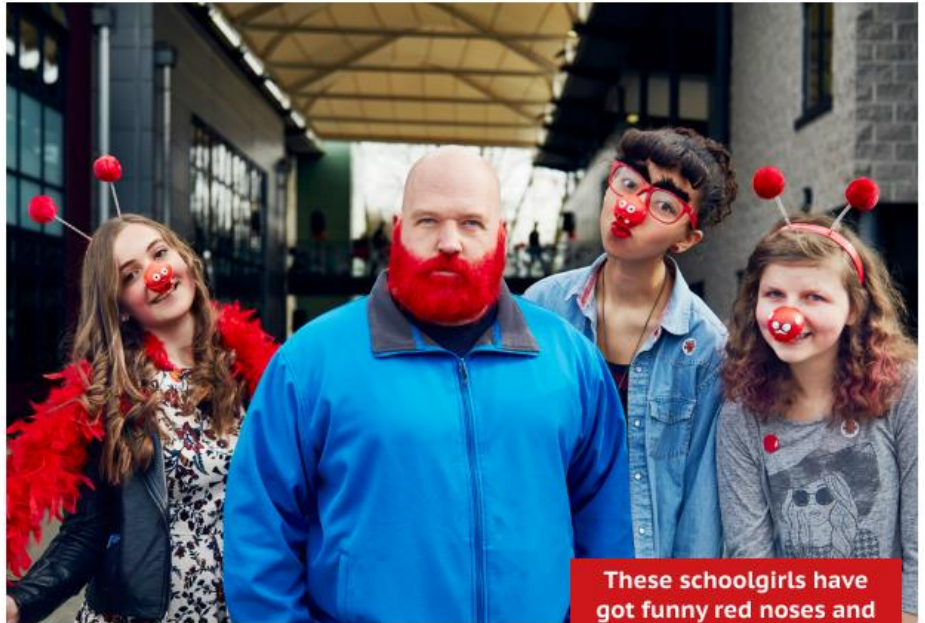
These schoolgirls have got funny red noses and antennae. Their teacher has got a cool red beard!

Comedians and schoolchildren are the stars of Red Nose Day. Comedians make funny TV shows and serious documentaries. In 2015, six million school children participated and they raised £7.1 million! A popular activity is having a special "red no uniform day".