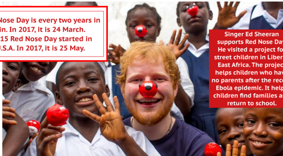
Singer Ed Sheeran supports Red Nose Day. He visited a project for street children in Liberia, East Africa. The project helps children who have no parents after the recent Ebola epidemic. It helps children find families and return to school.

Red Nose Day is every two years in Britain. In 2017, it is 24 March. In 2015 Red Nose Day started in the U.S.A. In 2017, it is 25 May.